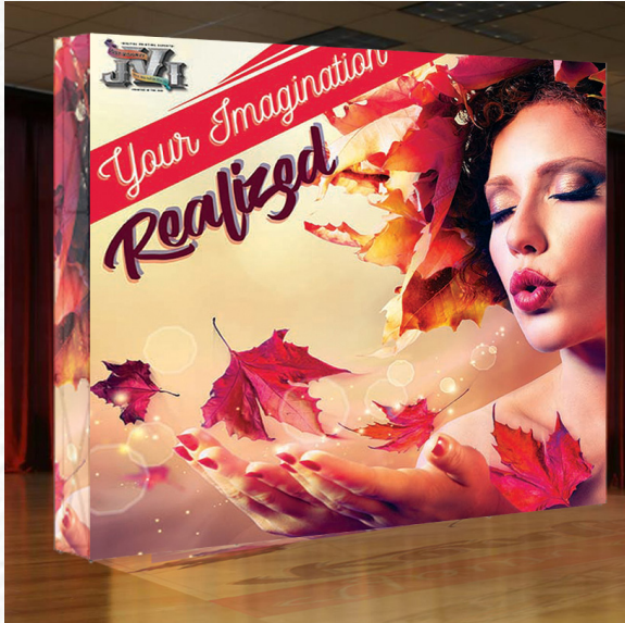
Backlit SEG Graphics on a JVI Modular 4 x 3 Frame