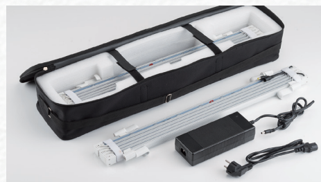
LED Curtain Kit