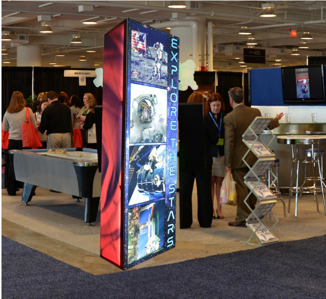
Backlit SEG Graphics on a JVI Modular 1 x 3 Frame